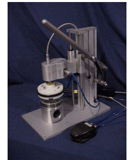
Figure 3— Manual Test Fixture